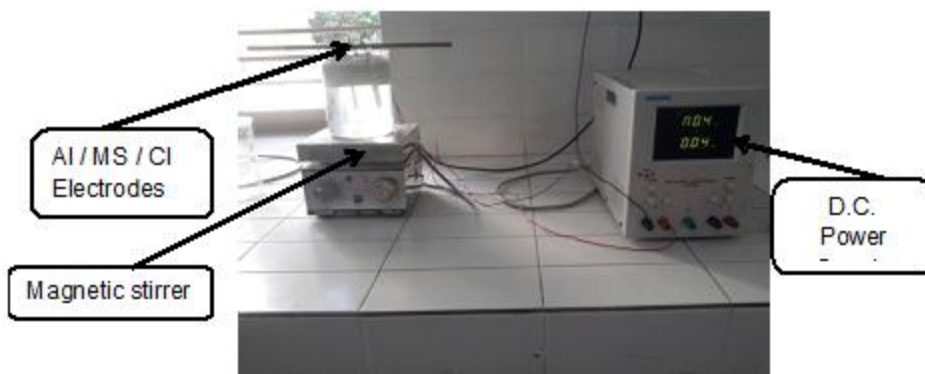
Figure 1: Electro-Coagulation Set up

Electro coagulation reactor with electro disconnected in parallel was used in the experiments. The reactor having a volume of 0.4 liter was used. Aluminum plates, Cast Iron Plates, Mild Steel Plates were used as the electrodes for the experiments. A regulated direct current supply (0-30 V, 15 A) by Power Supplier was used for the experiments. The experimental setup is shown in Figure 1.